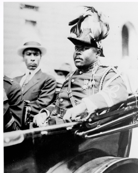
Garvey in Harlem, 1922

"The ends you serve that are selfish will take you no further than yourself but the ends you serve that are for all, in common, will take you into eternity."